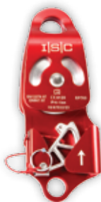
CE PCA-1272 Double self-blocking pulley with aluminium side plates. 2 aluminium sheaves 62 mm dia. For rope up to 13 mm dia. MBS: 40 kN