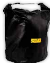
PCA-0105 XXL Extra Large transport bag (50 l). Fits molded backpack PCA-0104.