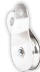
PCA-1274 Single swing side pulley with stainless steel plates. 1 aluminium sheave 100 mm dia. For rope up to 13 mm dia. WLL: 22 kN