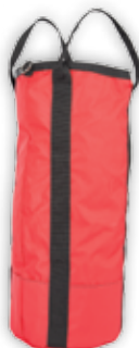
PCA-1257 Large Cap.: rope 12 mm x 150 m