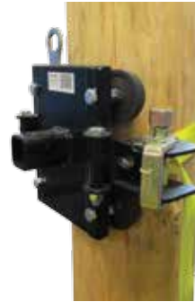
PCA-1263 Winch anchor system for trees and poles with 3 m strap. Use with PCA-1264 or PCA-1268.