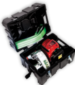
PCA-0102 Purpose built transport case with molded locations for the PCW3000 and accessories. Fits molded backpack PCA-0104.