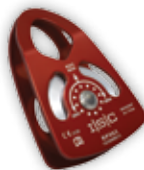
CE PCA-1292 Single swing side pulley - all aluminium. 1 sheave 63 mm dia. For rope up to 13 mm dia. MBS: 50 kN