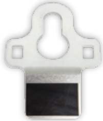
PCA-1261 Winch anchor plate for towing balls up to 58,7 mm diameter.

We have created anchoring accessories for many types of anchor points: trees, poles, vehicles or other anchor points heavier than the load. Choose them according to your work situations.