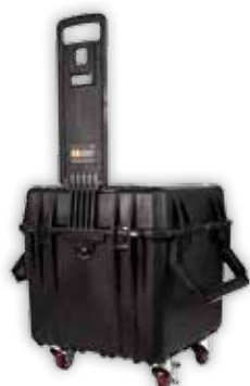
PCA-0340 Waterproof and airtight case with removable casters and folding top handle for winches and accessories.

No matter where you need to bring your winch, it will be easily carried and protected in one of our transport options. You can even carry the PCW3000 on your back, thanks to the molded backpack.