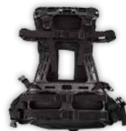
PCA-0104 Molded backpack for Transport Case PCA-0102 and Rope Bag PCA-0103 or XXL Extra Large Transport Bag PCA-0105.