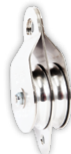
PCA-1273 Double swing side pulley with stainless steel plates. 2 aluminium sheaves 100 mm dia. For rope up to 13 mm dia. WLL: 44 kN