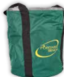
PCA-1257XL X-Large Cap.: rope 12 mm x 200 m