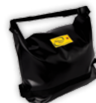
PCA-0103 Vinyl - For Backpack PCA-0104 Cap.: rope 10 mm x 50 m