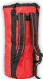
PCA-1256 Medium (w/shoulder straps) Cap.: rope 12 mm x 100 m rope 10 mm x 200 m