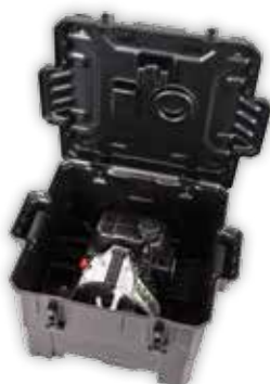
PCA-0100 Purpose built transport case with molded locations for the PCW5000 and many accessories.