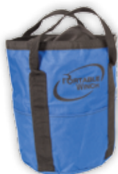
PCA-1255 Small Cap.: rope 12 mm x 50 m rope 10 mm x 100 m

These bags are great for carrying your rope and small accessories around the woodlot or elsewhere. Store your rope by pushing it in the bag, tangle free!