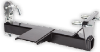
PCA-1264 Winch support for vertical pulling, with swivel pulley. Installs on PCA-1263, PCA-1265, PCA-1267 or PCA-1501.