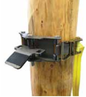
PCA-1269 Winch anchor system for trees and poles with 3 m strap.